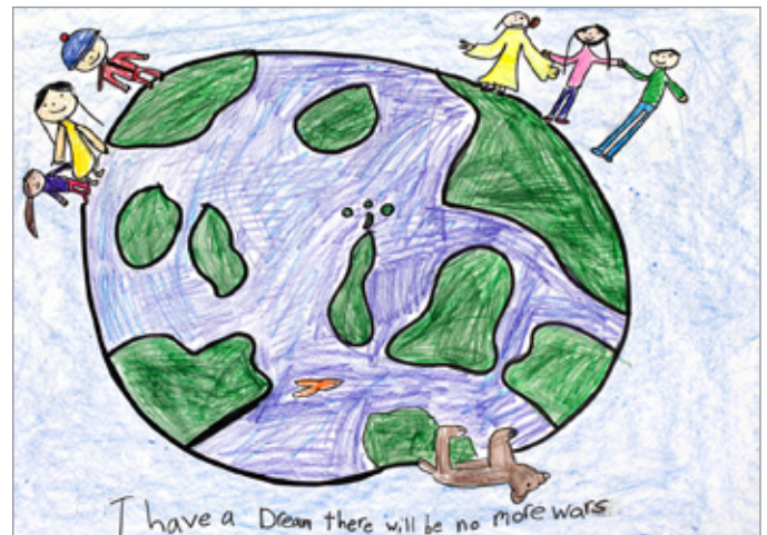
Poppy Blatherwick, NO MORE WARS